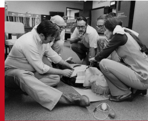
A CPR training course in 1977.

Other goals by 2030 include increasing the rate that laypeople respond to cardiac arrest with CPR to over 50% from its current 40.2% and ensuring 100% of cardiac arrest victims receive high-quality CPR within one minute and AED application within two.