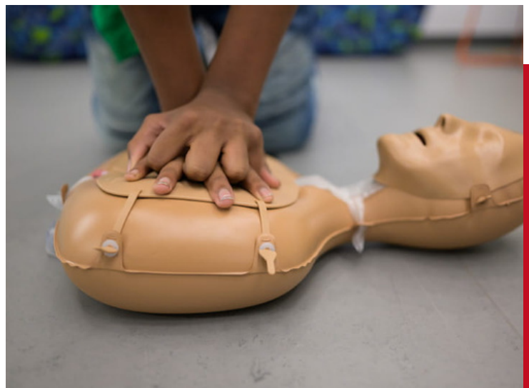
Modern CPR training manikins provide feedback on the quality of trainees' chest compressions and are available with female anatomy and different skin tones to increase inclusivity.

While experts note that the best CPR is still CPR with rescue breaths, the 2008 science-backed birth of Hands-Only CPR — chest compressions without rescue breaths — marked a shift in accessibility, meaning more people would be willing and able to be rescuers, said Liz McKnight, a senior director of product marketing for the AHA's Emergency Cardiovascular Care department. In 2012, the AHA launched a campaign to raise awareness of Hands-Only CPR to reduce barriers and increase the likelihood of people performing CPR during an emergency.